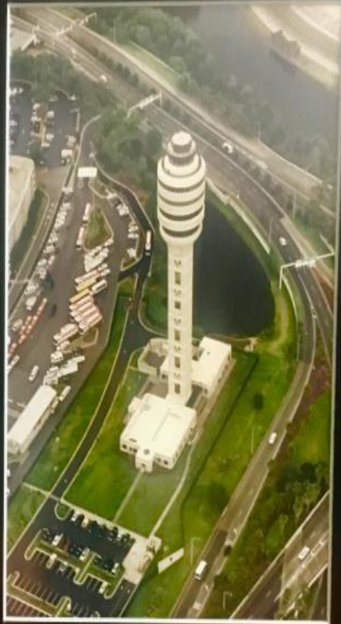
Air Traffic Control Tower Orlando, FL 2002 Wassell Phelps Construction Co. Federal Aviation Administration - 401 340