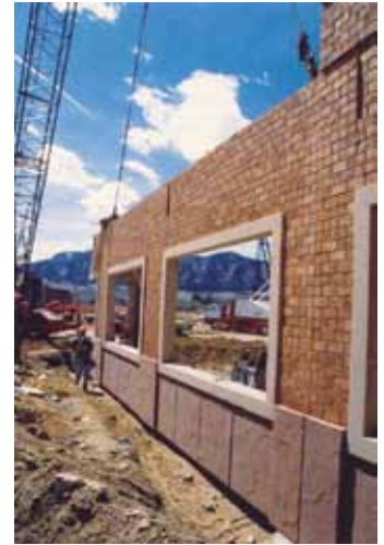
This close-up of panels with integrally cast thin brick, acid-etched window trim and etched red sandstone form finer areas shows some of the detail provided at the Sybase/Information Connect’s project.

Because of this approach, the building fits nicely into the surrounding setting of the research campus. Along with a concrete-tile roof, punched windows and third-floor balconies, the brick-set precast let us tie our design to the university’s motif without bowing completely to the campus’s Tuscan design features.