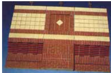
Figure 9 Brick and acid-etched finish.

German limestone was cast into the precast and the exposed concrete surfaces were lightly sandblasted to resemble sandstone in the project shown in Figure 8 .