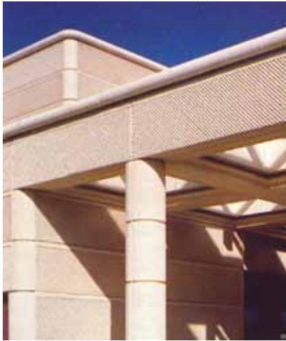
Figure 4 Form liner and sandblasted finish.