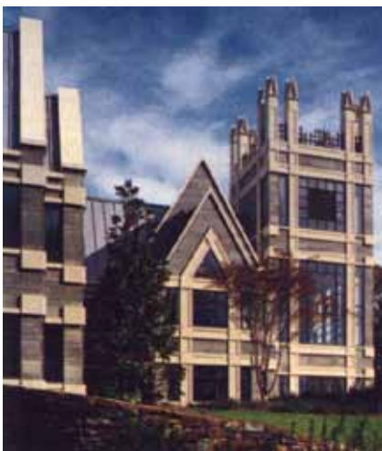
Figure 8 Natural stone and sandblasted finish.