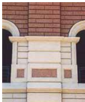
Figure 2 Multiple mixes with retarded and sandblasted finishes.

The precast in Figure 3 offers a golden hue with highlights of brown and sienna. Alternating surfaces of retarded, exposed-aggregate and acid-etched precast create a subtle variation of textures.