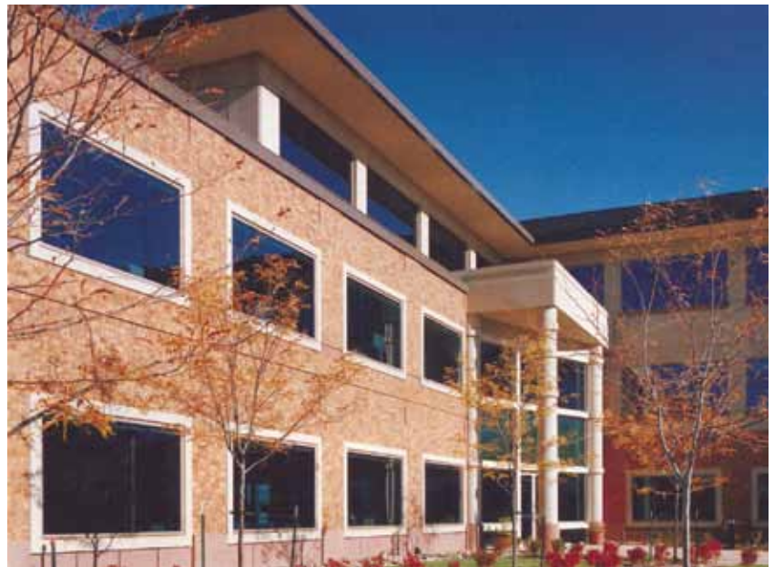
Texture and cost-savings are the result of OZ Architecture’s use of a combination of columns and spandrels, as well as integrally cast-in brick load-bearing wall panels at Sybase/Information Connect’s division headquarters at the University of Colorado’s Research Park in Boulder.