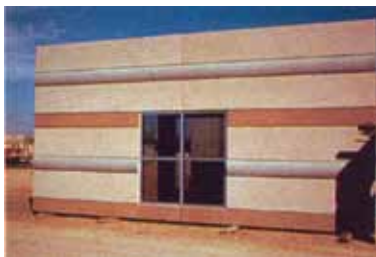
Figure 7 Multiple mixes with acid-etched finish.