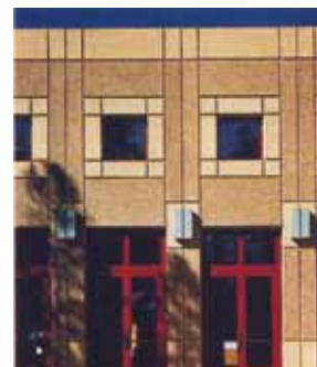
Figure 3 Retarded and acid-etched finishes.