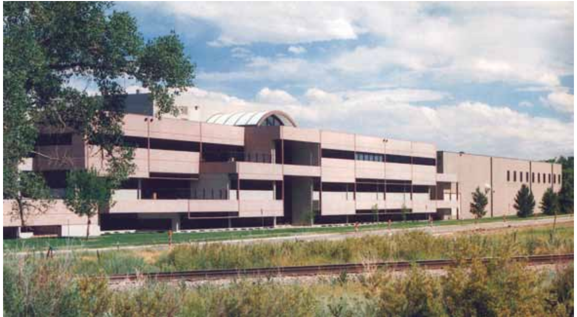
The award-winning expansion of Pfizer's Valleyleab campus features flat sandblasted panels over an exposed steel structure.

To incorporate precast into the Valleyleab project, we designed a simple flat-panel, with an acid-etched finish as a skin over the steel superstructure. Since then, I have had a number of opportunities to use precast as a viable system in projects, not only as a cladding, but increasingly as the material of choice for a building's superstructure as well.