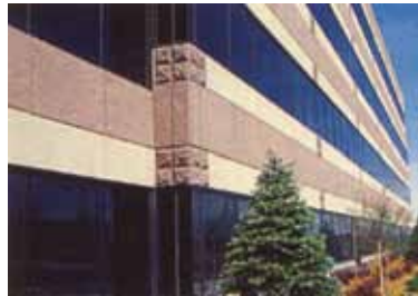
Figure 5 Multiple mixes with acid-etched and form-liner finishes.