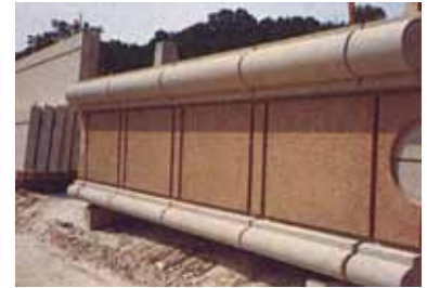
Figure 6 Multiple mixes with sandblasted and acid-etched finishes.

In Figure 4 , the use of a lightly sandblasted finish frames the bands of alternating diagonal ribs with a fractured texture. These pieces were cast from a premolded form liner.