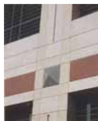
Figure 1 Light and deep sandblast with granite and terra-cotta inserts.

The importance of the separation provided by the reveal feature depends on the configuration of the unit on which the finishes are combined. The importance of the separation also depends on the specific types of finishes involved.